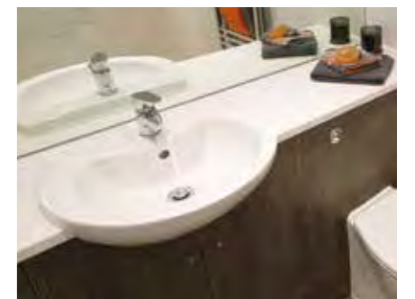
Hotels and Leisure Facilities