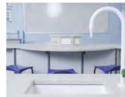
Schools and Education